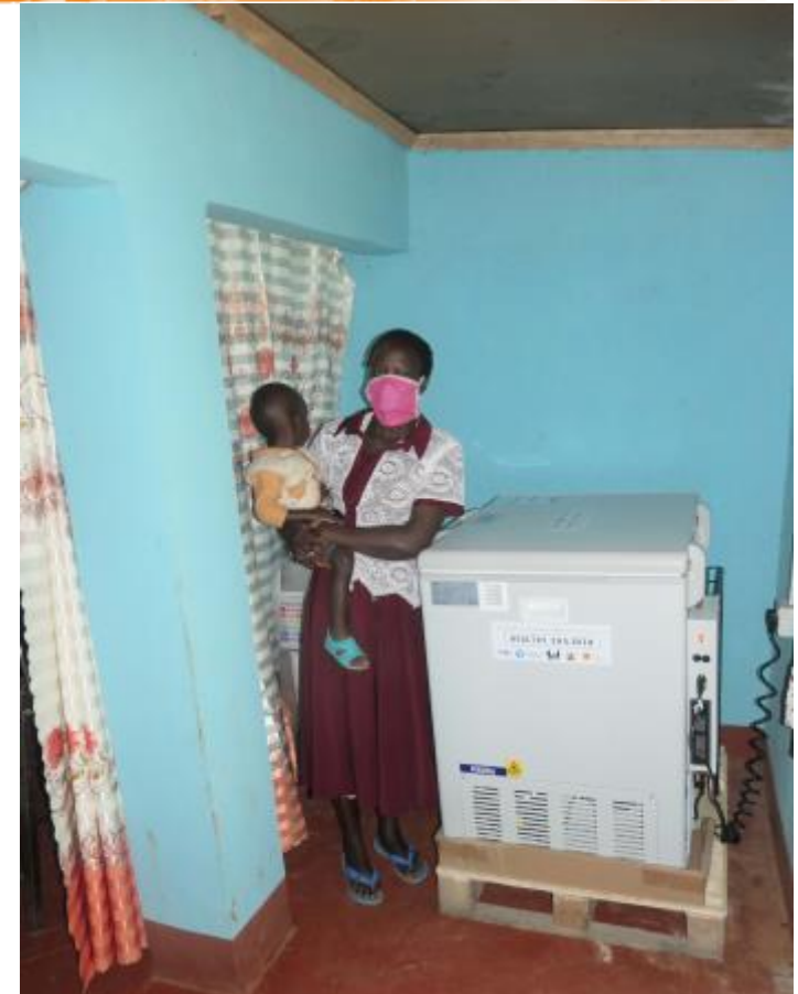
Mother & baby welcome arrival of the new fridge at Sumoiyot Dispensary