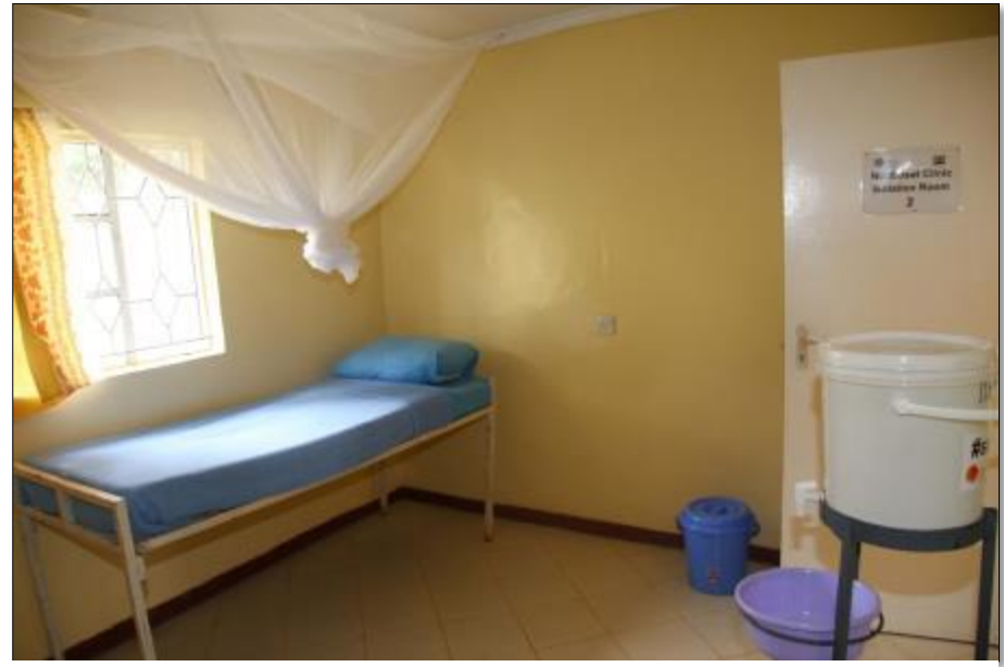
Isolation wards Ndubusat Clinic