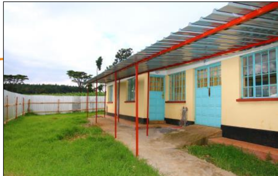
Handover of isolation ward to Londiani Sub County Hospital