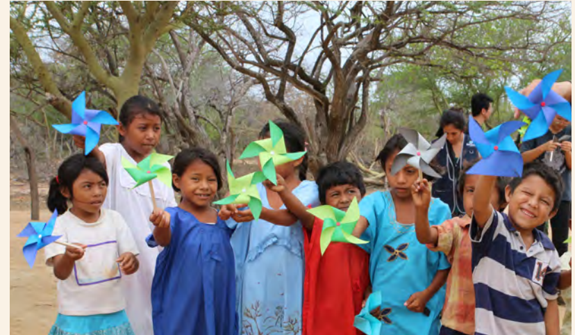
Traditional house of Wayuu and children

Because they live spread in desert, access and qualities of education are a chronic problem. This problem cause a vicious circle of poverty for Wayuu. Our communities have a multi-grade primary school in community but middle school is more than 30 min away by car.