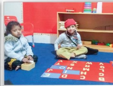
Lifelong Learning and Education