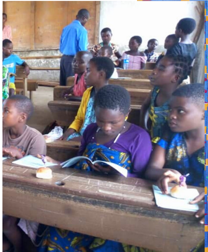
Top: Flame of Divine Love Orphanage Bottom: Patronage Camp