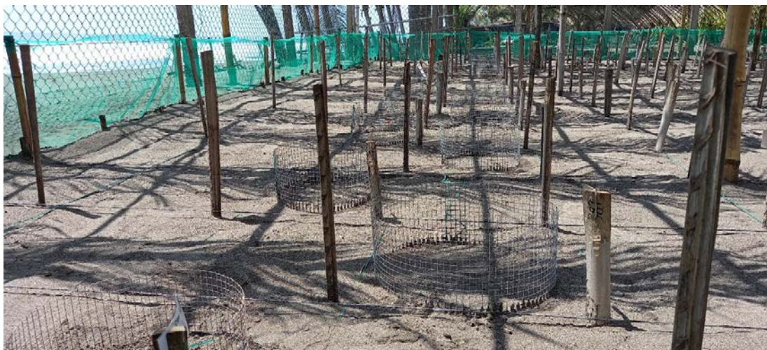
Incubation of olive ridley eggs