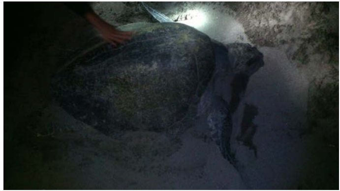
Incubation of 112 green turtle eggs in Barra de Santiago