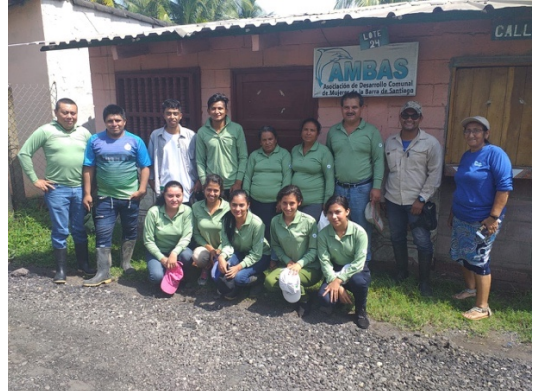
Sea turtle hatchling release event with managers and youth network of the Apaneca Biosphere Reserve - Ilamatepec, September 27, 2019