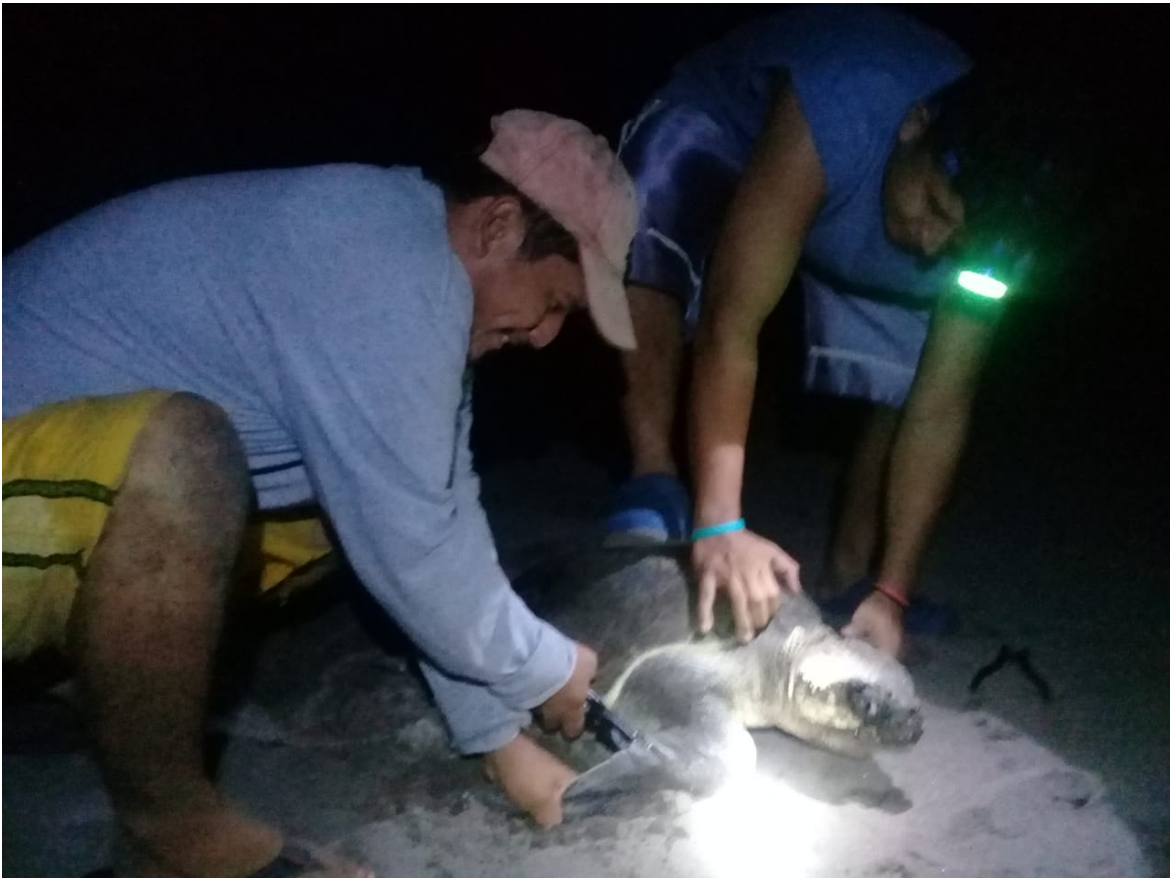
Trainings and tagging of nesting sea turtles, September 24, 2020