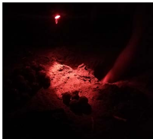
Egg collection on closed “veda” nights at Barra de Santiago beach and El Tamarindo beach