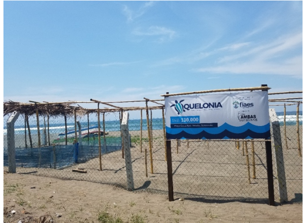
Building of the Costa Azul hatchery, July 31, 2019