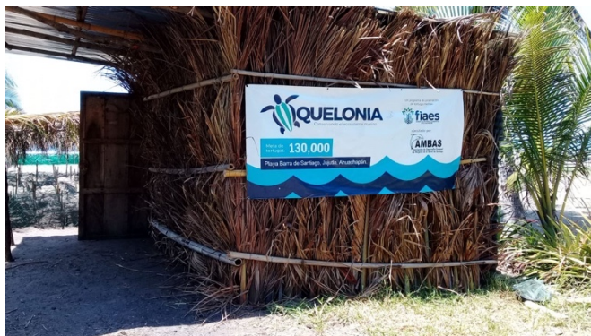
Building of the Barra de Santiago hatchery, July 18, 2019

Building of the El Tamarindo hatchery: since this hatchery was not removed the previous season, the interior was rehabilitated. The substrate was prepared with a change of sand, the roof was improved, and we changed the beams made of bamboo and palm, as well as built a canopy outside to welcome the public to the hatchery facilities. The hatchery has dimensions of 18 x 18 meters, having 324 m 2 , and can fit 1,296 nests inside. The hatchery was filled with sand to form a high edge, for protection against strong waves.