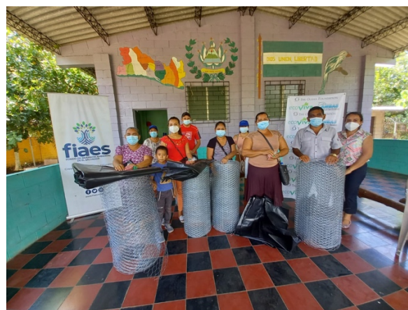
Training in soil microorganisms preparation and delivery of supplies to beneficiaries, November 27, 2020