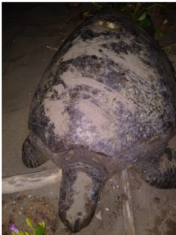
Incubation of 70 green turtle eggs in El Tamarindo