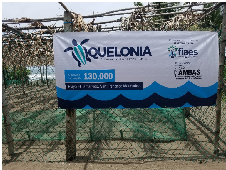
El Tamarindo hatchery construction, July 19, 2019

Building of the Costa Azul hatchery: This hatchery was built completely from scratch. A prior meeting was held with the tortugueros and the local community organization (ADESCO) to identify the optimal site. Finding the ideal place, the hatchery was built. The dimensions are 14 x 15 meters, 210 m 2 , with space for 840 nests inside. The site was completely prepared, the