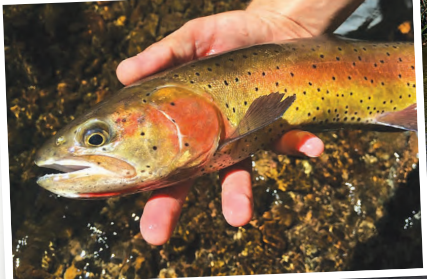
Bright-orange Lahontan cutthroat (pictured) are the state fish of Nevada. The imperiled species depends on cold streams like McDermitt Creek, which flows through Disaster Peak Ranch (right)

As we work to identify the ideal long-term steward for the ranch, we are positioning the property for long-term habitat conservation and compatible grazing. Together with the U.S. Fish and Wildlife Service, Oregon Department of Fish and Wildlife, Nevada Department of Wildlife, Trout Unlimited and other partners, we are working to realize a shared hope of Lahontan cutthroat trout surviving into the next century and beyond.