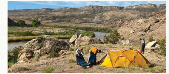
The Gunnison River, inside the Dominguez Escalante National Conservation Area.

Much of Colorado's lower Gunnison is protected within places like the BLM's Dominguez-Escalante National Conservation Area. But stretches of the lower river remain vulnerable. To fill those gaps, WRC has purchased and conserved 954 acres and eight miles of Gunnison riverfront since 2008. In 2020, following a seven-year effort,