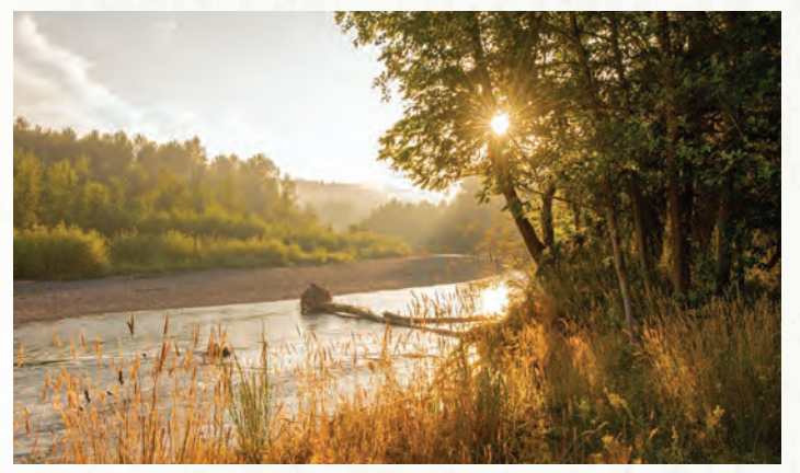
WRC protected one of the most extensive intact stretches of riverfront remaining on the lower Nisqually River.

Once community forest funding was approved by the Washington State Legislature in 2021, a new future was locked in for the property: The Nason Ridge Community Forest. Now, Nason Ridge will forever be managed for the benefit of fish, wildlife and the people of Washington and beyond.