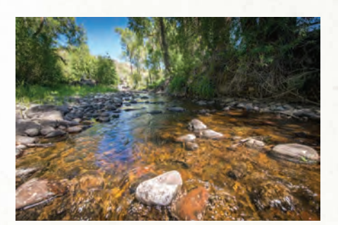
WRC returned desperately needed flows to a reach of the Little Cimarron that was typically drawn dry in summer and fall.

we conserved another 150 acres along a mile-long reach, including prime camping flats for boaters. With funding from the Land and Water Conservation Fund, we are helping to keep the Gunnison a sanctuary for fish and wildlife while expanding the Dominguez-Escalante NCA.