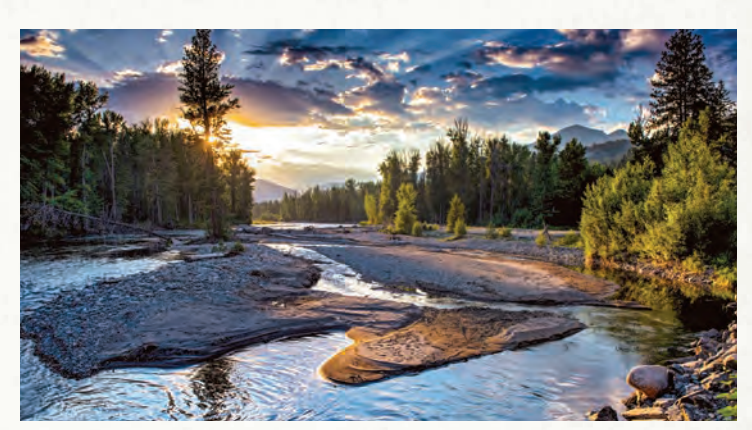
Above, the Methow River glows beneath an early-summer sunset. WRC's work here helped preserve two critical properties along the Methow and Chewuch rivers.

On the Chewuch, we conveyed the historic 328-acre Wagner Ranch to the Methow Conservancy. Wagner Ranch, which WRC purchased in 2018, was one of the largest