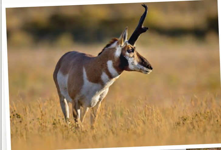
A hiker takes in the view of the lower John Day at McDonald's Ferry Ranch (right). The property contains prime sagebrush-steppe habitat that wildlife such as pronghorn (pictured) depend on.

With its combination of history, habitat and recreation, McDonald's Ferry Ranch will be a superb addition to the growing conservation and recreation landscape WRC is assembling on the John Day River, the longest undammed river west of the Rockies.