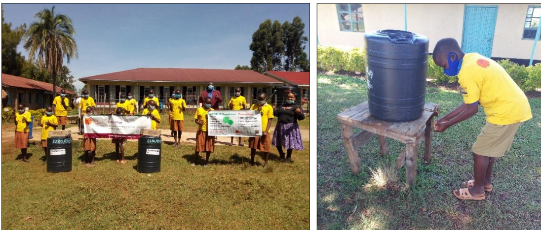
Distribution of COVID-19 resources to schools, January 2021