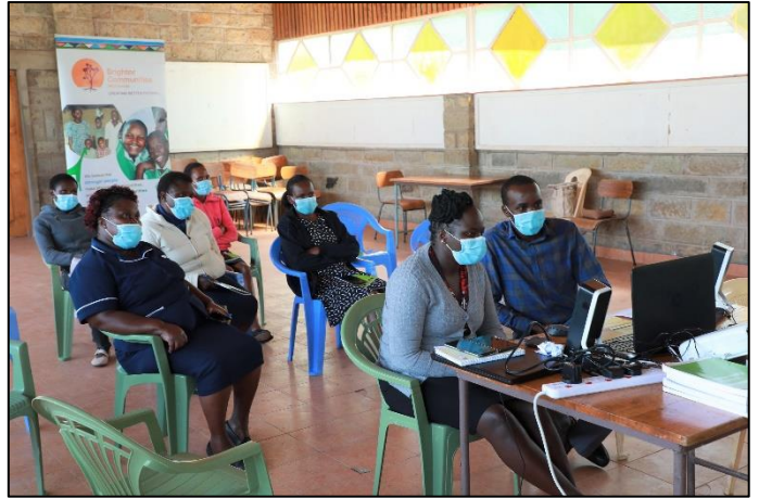
Online workshop with Irish Health Care Workers, Londiani, July 2021