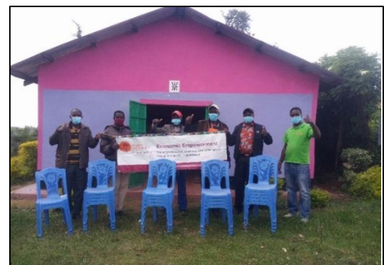
Distribtuion of chairs for hire to Mission Self Help Group – August 2021