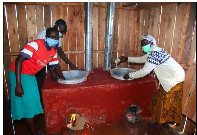
Smokeless stove built in Kutung Primary

In 2020 an outbreak of COVID-19 also occurred across three prisons in Kericho. Brighter Communities Worldwide supported the Ministry of Health to contain the outbreak through supplying mattresses and blankets to those affected.