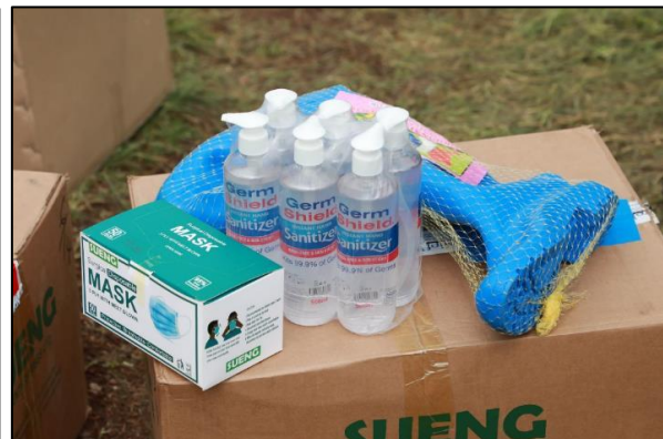
Delivery of PPE to Londiani Sub County Hospital, July 2021