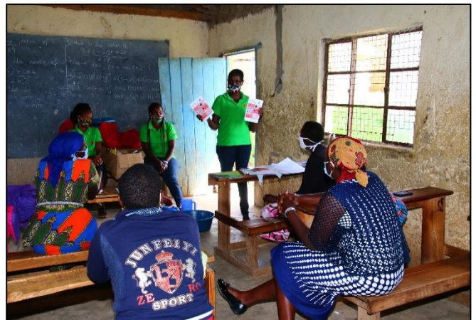
Various Menstrual Health Ambassadors Trainings

A number of activities have taken place to date: