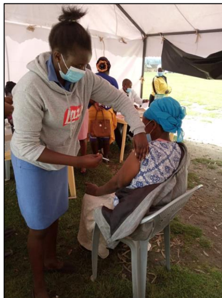
Vaccine Outreach Clinic, Londiani Market September 2021