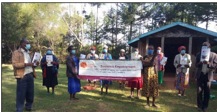
End of 3 day business course, Tamboiyot Women Self Help Group, 2021

Since March 2020 Brighter Communities Worldwide has supported 50 community groups to start income generation projects – some related to COVID-19 such as mask making, tree nurseries, equipment hire, chicken rearing, coffee planting, bee keeping, goat rearing and tomato seedlings amongst other projects. Households across Kericho have seen a large reduction in their income since March 2020. Projects like these will contribute to alleviating some of this reduction over time. Of the 50 groups, 22 participated in business workshops and this will continue over the coming months. There are 995 (419M, 576F) members in these groups of whom 46.2% are young people, and 12 projects are supporting 54 people with disabilities.