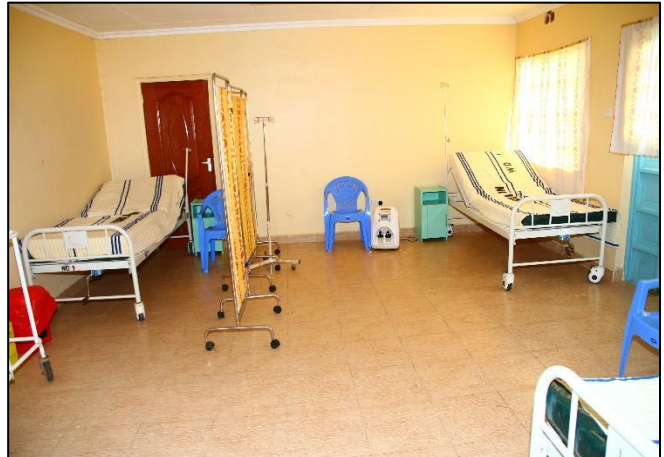
Isolation Ward, Londiani Sub County Hospital