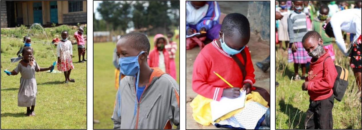
Community Learning Groups, Kutung, September 2020

In response to school closures in March 2020, Brighter Communities Worldwide together with community leaders, parents and volunteer teachers set up community-based learning groups across 6 villages which reached 1,224 (554B, 670G) students. Each group catered for 15 children and was supervised by 2 volunteer teachers. The children were enabled to focus on their school subjects as well as life skills, time for play and social skills. The students were provided with a hot meal as many families struggled to feed themselves. Girls were especially vulnerable to violence and exploitation while schools were closed. These groups gave support and a safe place to be.