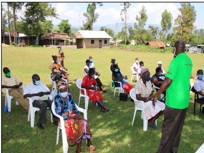
Training of Community Health Volunteers, Koru. May 2020

We began preparing for COVID-19 in February 2020 by including sensitisation of communities and schools as part of our regular engagement activities across all our programmes. We introduced a training module for all Remote Emergency Care Instructors and Facilitators, and all staff were trained in both COVID-19 and Incident Management in early March. Our Incident Management teams in Ireland and in Kenya were stood up by mid-March. The office in Kenya closed to the public with the majority of staff working from home.