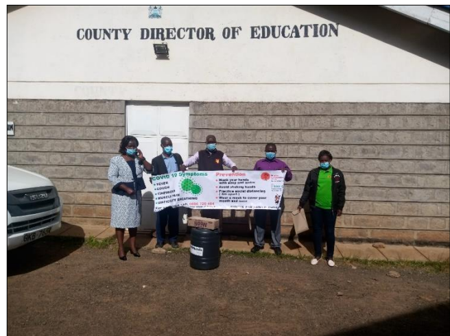
Kericho County Director of Education Office Distribution, June 2021

As a result of our strong partnership with the Ministry of Health (MOH) we were invited to join the Emergency Response and Preparedness Team at Kericho County level. This team includes all cadres of health workers, public health representatives, disease surveillance experts, Governor’s office (police, administration) and partners (Brighter Communities Worldwide and the Kenyan Red Cross). Its function