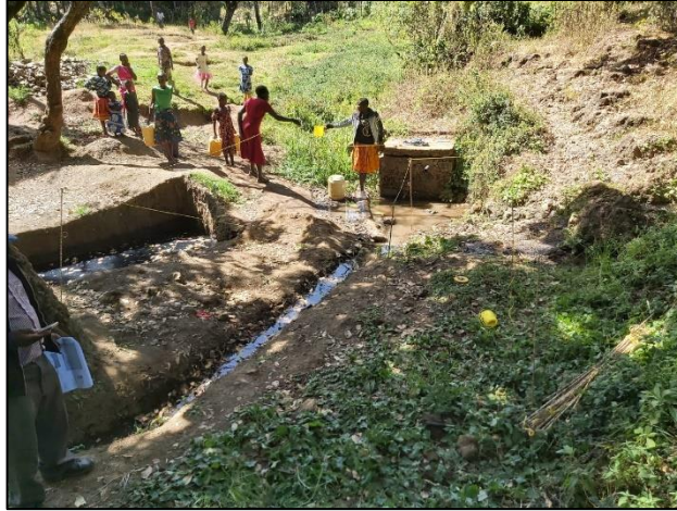
Work in progress at the Kimaut Water project, June 2021