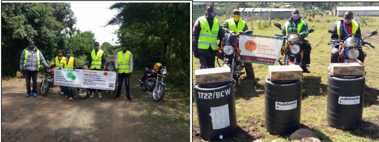
Boda Sensitisation, Maji Moto Route Fort-Ternan, July 2021

Young people have been affected adversely by COVID-19. Our focus is on sensitizing them to become COVID-19 Ambassadors in their community and on supporting their income generation projects. This includes working with “boda” drivers (motorbike taxis) and youth groups across the region. Since March 2020, we have sensitized 3,346 Boda drivers in 6 sub counties. This involved sensitizing the drivers on the signs and symptoms of COVID-19, how to protect themselves; providing masks and hi-vis vests with key messages to the drivers. Handwashing facilities and soap have been provided in 200 stages . All drivers were encouraged to ensure their passengers took the necessary COVID-19 precautions before boarding the bike.