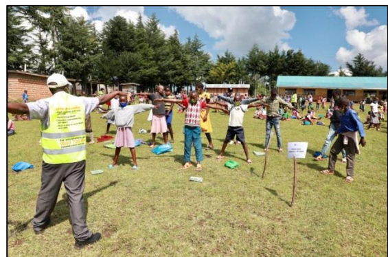
Community Learning Groups, September 2020

There has been an increase in social issues including alcohol and drug abuse and gambling. While school went online for children in many parts of the world this was not possible in Kenya where most homes do not have electricity let alone internet connectivity. There is a real fear of a ‘lost generation’ of children resulting from the pandemic who will be separated from the support and safeguarding structures that education offers as a means out of poverty.