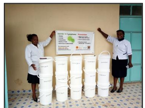
Health Clinic staff receiving buckets, soap and posters for handwashing stations, March 2020

Between March 2020 and September 2021 a total of 924,626 beneficiaries were reached through our response. This includes 209,528 men, 228,577 women, 235,394 boys and 250,960 girls. We would like to express our deep gratitude to our donors, staff, volunteers and supporters who made our response possible. Asante Sana!