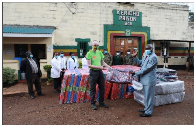
Distribution of resources to Kericho Prison