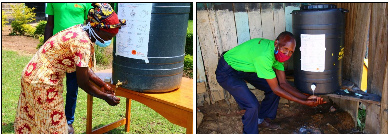
Handwashing Sensitisation, May 2020

Brighter Communities Worldwide leveraged its volunteer network to sensitise households across Kericho on COVID-19 and supported vulnerable households with soap and handwashing facilities. In partnership with the Ministry of Health Brighter Communities Worldwide trained 2,784 volunteers who in turn have sensitized households across their community while adhering to the COVID-19 guidelines. The 2,784 (1,375M, 1,409F) volunteers have sensitised 156,193 Households across communities with 60,767 new Households reached in 2021, among which 51,888 were given soap. 790,000 beneficiaries were reached since the exercise began. In addition 22 Town Centres, and a number of government buildings (Kericho Prison, Administrative Offices, and Police Stations) in Kericho received sensitisation, handwashing and soap.