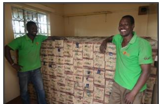
Delivery and distribution of soap and water containers, March 2020