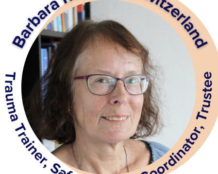
Trauma Trainer, Safeguarding Coordinator, Trustee