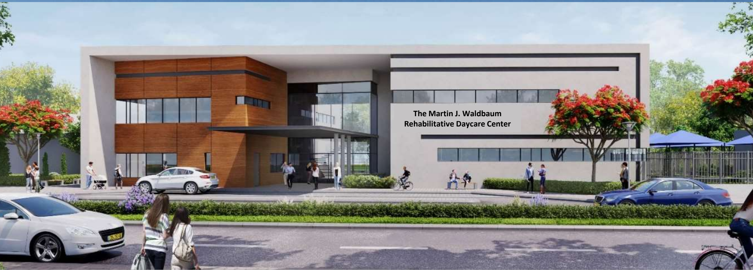
The Martin J. Waldbaum Rehabilitative Daycare Center

A CAPITAL PROJECT TO GIVE PRESCHOOL CHILDREN WITH DISABILITIES A BETTER START IN LIFE