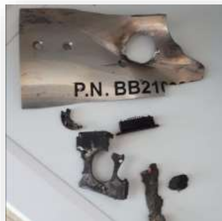
Iron dome casing and rocket fragments found on Chimes Israel early childhood center playgrounds and walkways in Ashkelon

Chimes Israel's two early childhood centers in Ashkelon, Shulamit and Shaked, are located in four residential homes that have been repurposed to serve as daycares. After the ceasefire, the Ashkelon municipal inspectorate went to the centers to assess damage. They discovered and cleared several rocket and Iron Dome fragments.