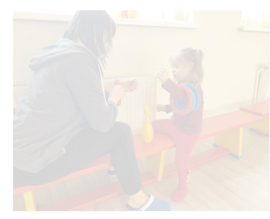
✓ Free-to-access rehabilitation therapies for children with disabilities