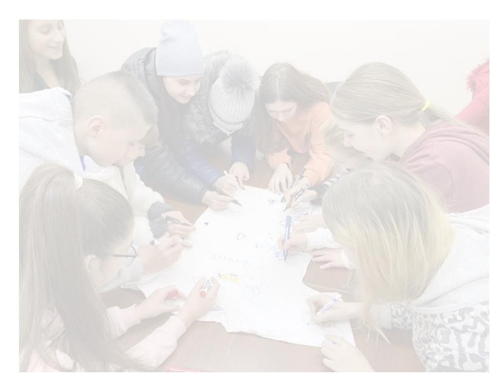
✓ Offer accommodation and "life skills" training to orphans