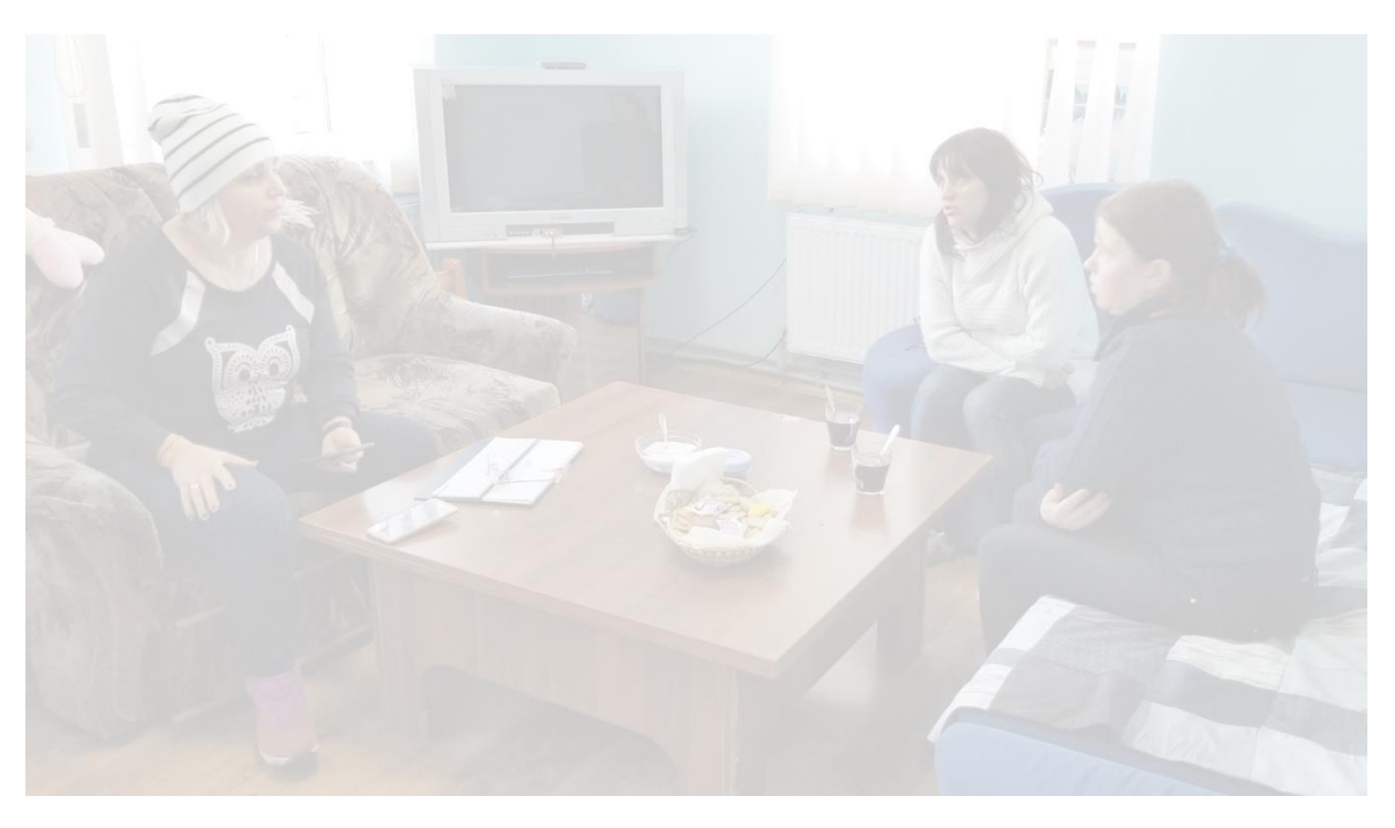
✓ Provide parental coaching skills to help young and inexperienced mothers.