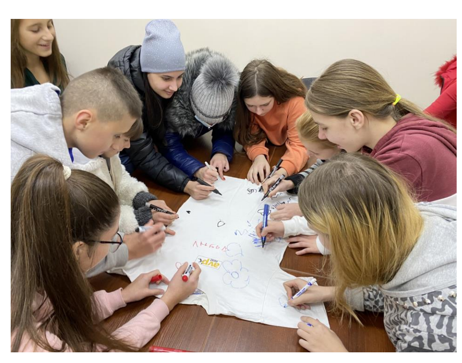
✓ Offer accommodation and "life skills" training to orphans