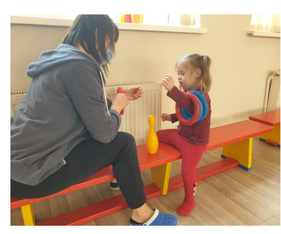
✓ Free-to-access rehabilitation therapies for children with disabilities