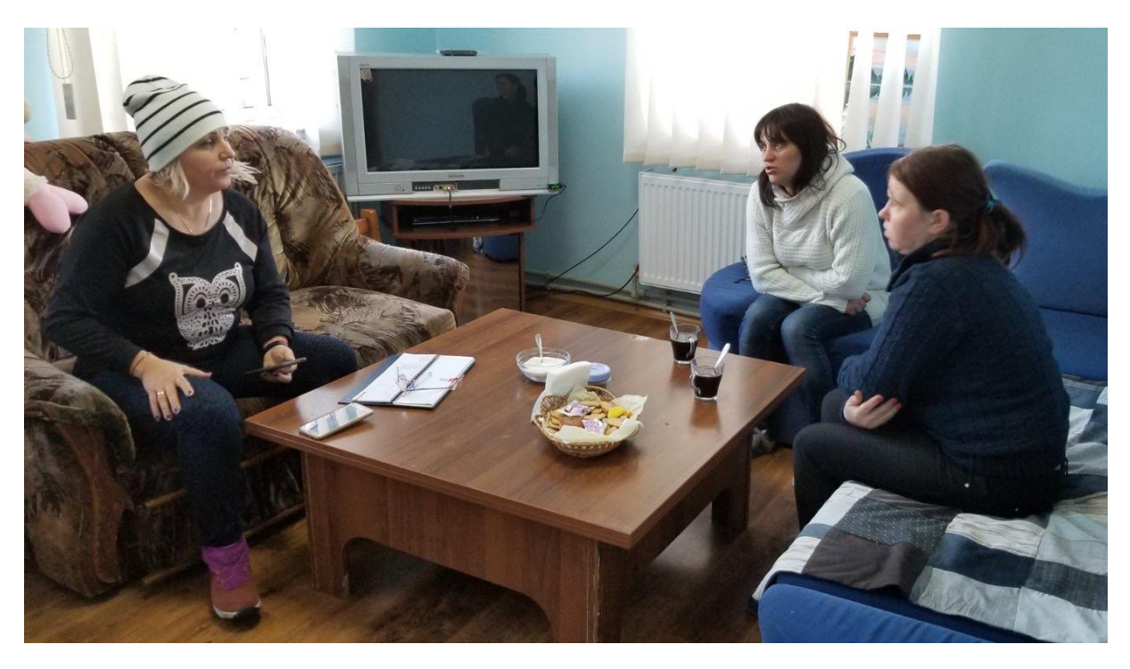
✓ Provide parental coaching skills to help young and inexperienced mothers.