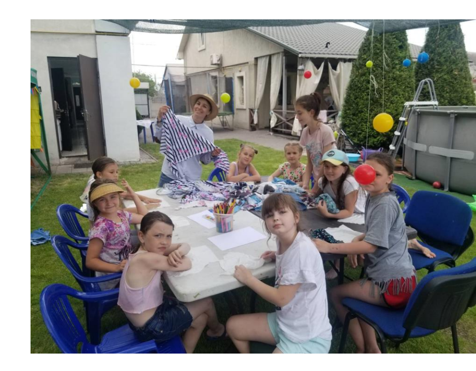
✓ Respite day care and after schools clubs