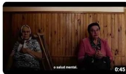
#Ucrania ¿Cómo lleva Médicos del Mundo la atención médica a las comunidades en... (How is Médicos del Mundo providing medical care to communities...)