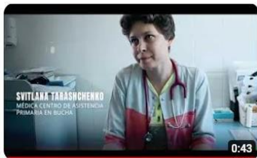
#Ucrania Qué hace el personal sanitario cuando no puede ofrecer a sus pacientes... (What do the health care personnel do when...?)