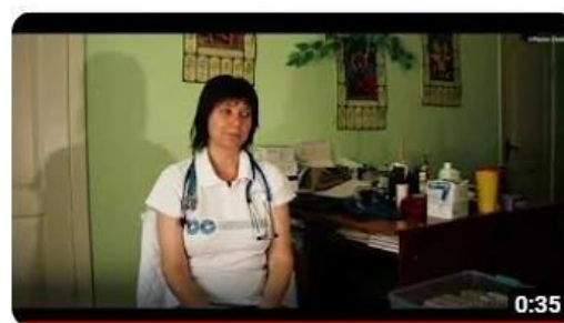
#Ucrania ¿Qué es lo primero que piden al personal médico quienes viven en el... (What is the first thing asked to health professionals...?)