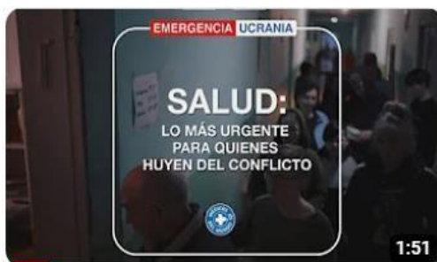
SALUD: lo más urgente para quienes huyen del conflicto en #Ucrania (HEALTH: the most urgent need to those fleeing from the conflict in Ukraine)