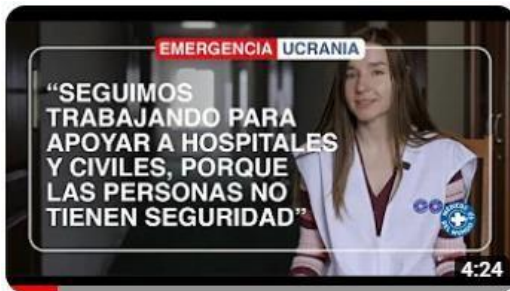
#HuirXCuidar un agradecimiento a nuestro personal ucraniano

(A thank you to our Ukrainian personnel: “We keep working to support hospitals and civilians because people lack security)