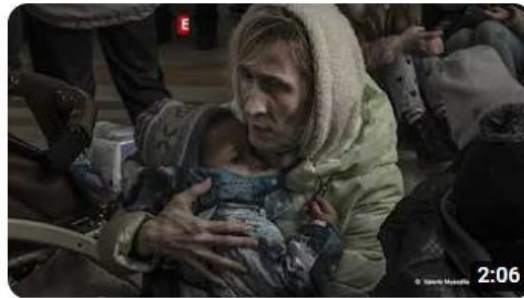
El personal sanitario sostiene la vida en la emergencia de #Ucrania

(A thank you to our Ukrainian personnel: “We keep working to support hospitals and civilians because people lack security)