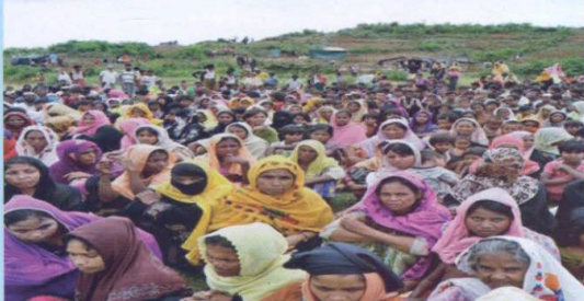
নারী ও শিশু রোহিঙ্গা জনগোষ্ঠি ক্যাম্পে খাবারের জন্য অপেক্ষমান।