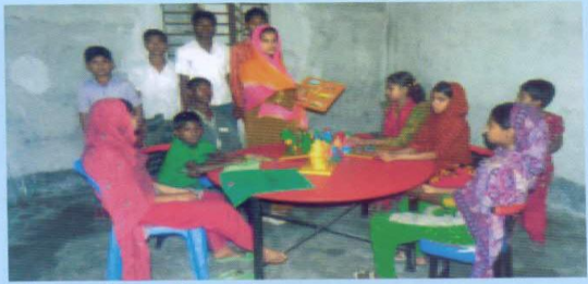
ডিডিইএফ স্কুলের শিক্ষকগণ প্রতিবন্ধী ছাত্রছাত্রীদের শিক্ষা দিচ্ছেন।