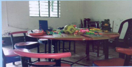
ডিডিইএফ কর্তৃক পরিচালিত রায়হানপুর ডিজএবল স্কুল এর শিক্ষা উপকরণ