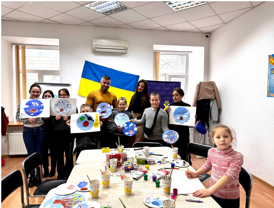
Art therapy session with IDP children

Art therapy for children has the following benefits: Expression of emotions. Self-expression and self-esteem. Development of creative thinking. Relieve stress and anxiety. These factors together help children develop emotional well-being, improve communication, develop concentration and imagination, and find ways to solve problems.