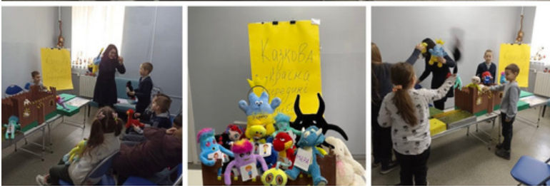
Conducting a psychological class "My fairy tale", Odessa