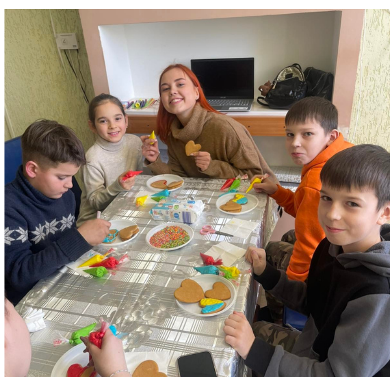
Master class on painting gingerbread. city of Ovidiopol

Painting gingerbread is a wonderful creative activity for children. Here are some of the benefits of doing this: