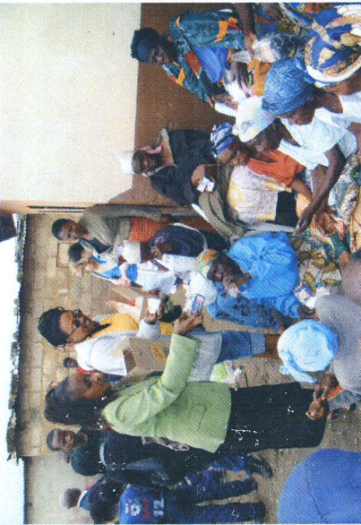
Providing Basic Nutrition and Essentials to the underprivileged senior citizens.