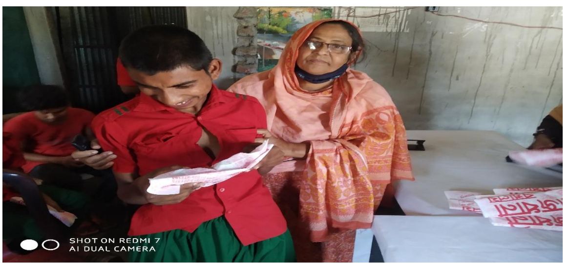
This Program is implemented under Support for Education ,Health Services activities with Financial support of Bangladesh National Social Welfare Council ( BNSWC ) and Global Giving Foundation ,USA.

During the Year Proships several Conducted Medicine distribution events for the Young and children with Disabilities for reducing spasticity and Malnutrition . Numbers of 60 (Sixty ) Mentally illness with disabilities are received Medicine at Proships Dewangonj area office . In these issues Proships Director present and distribute in to parent of the Children with Disabilities the events. Mother are very happy to received medicine.