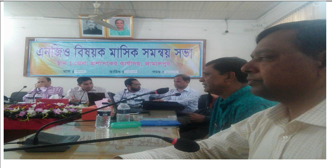
. Proships representative presence in District Coordination Meeting at DC office Jamalpur