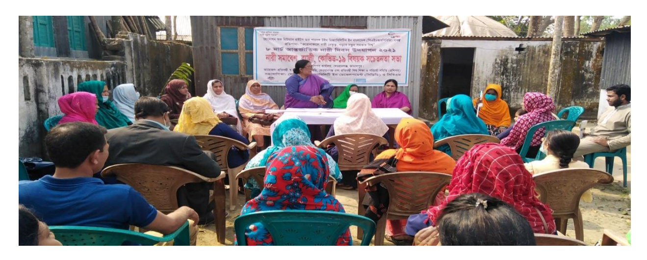
Organize Orientation on WASH Promotion with Mothers Group & Students