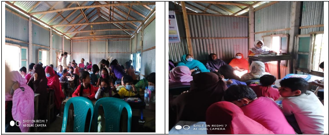
During the year proships conducted discussion meeting with several school children on Prevent COVID 19 Virus and others infected virus