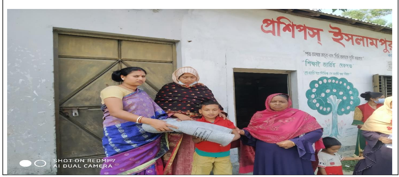
Discussion meeting with School Children on COVID19

Protibandhi Shishu Shiekkha O Paricharja Samity (Proships) During the year started we help to buy warm clothes for Person with disabilities to fight with rough and cold weather. Cold weather is big challenge for disable children and adults to have warm clothes and safe from cold. Mostly children suffered with flue, cold, fever and cough in winter due to lack of have warm clothes. During the year Proships conducted the Upazilla Govt. office and collected two hundred Blanket and distribute in to Proships Islampur Autism & Intellectually disable Children and adults Person with Disabilities on the dated 10<sup>th</sup> January 2022 at Proships office. Beneficiaries are very much happy for receiving blanket.