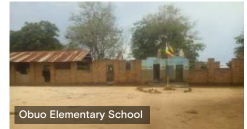
Obuo Elementary School