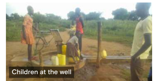
Children at the well