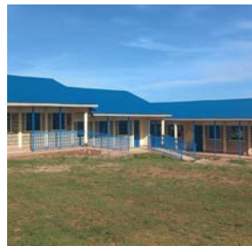
Photos from left: 1. completed dormitory for girls 2. WISER class of 2026 in front of new classroom block. 3. completed twin classroom. Opposite page: completed Dorcas Oyugi Library.