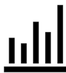
Statistical Data Analysis