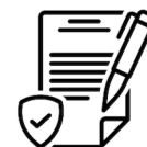
Materials and Guidelines