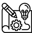
Survey Design and Analysis