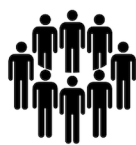
Community-Based Participatory Research

Our field team conducts immersive, community-based participatory research (CPBR) by residing in the deployment country to connect profoundly with the local deaf community, while our analytics team analyzes and synthesizes our findings for publication and dissemination.