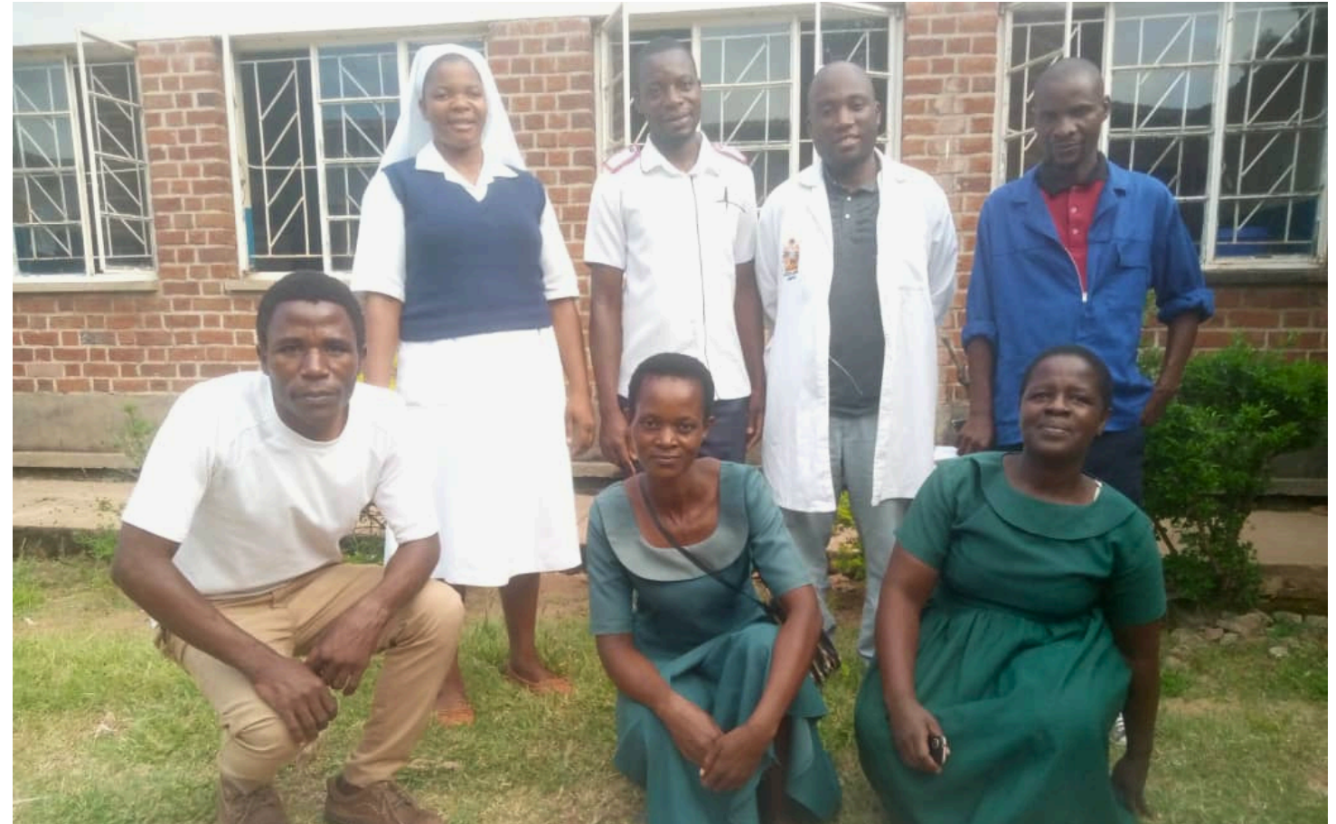
Staff at St Anne's Hospital in Malawi (2024)

By keeping in regular contact, Inter Care learned more about the hospital's situation: 'In this area, we have so many patients suffering from tooth decay and other conditions of teeth. Hence, they move a very long distance—up to 70 kilometers—to reach the district hospital for treatment. So, we see [a dental chair] being needed at our facility so that we can help them reduce transport costs and other resources since our [dental] service will be near them.'