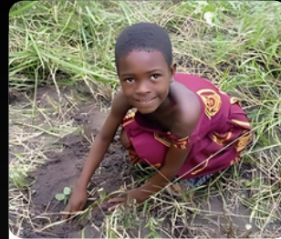
Tree Planting Project