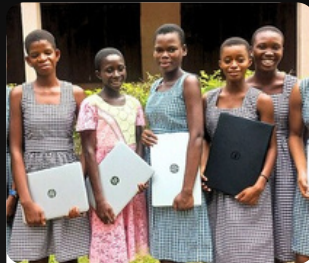
Digital Literacy Initiative