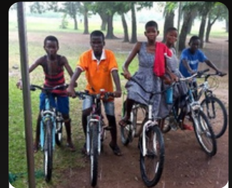
Pedal to Excellence