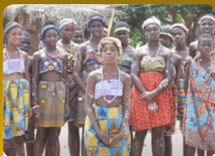
My Body is My Body Dance Competition Winners