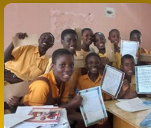
Pen Pal Program