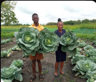
School & Community Garden