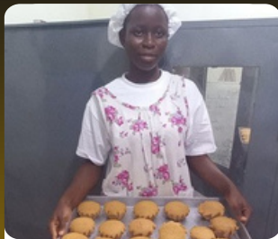
WIN Pastries Project