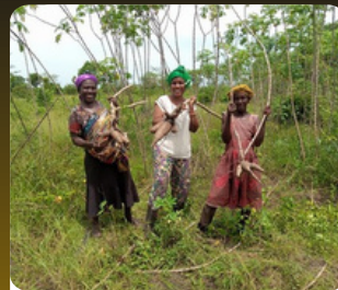
Women Farmers Program