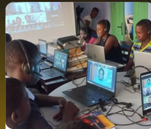
Virtual Global Exchange