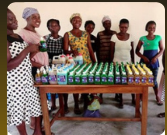
Liquid Soap Project