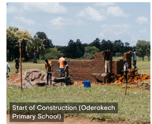
Start of Construction (Oderokech Primary School)