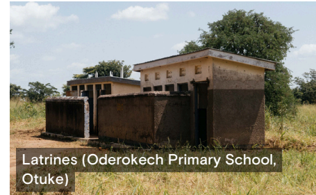
Latrines (Oderokech Primary School, Otuke)