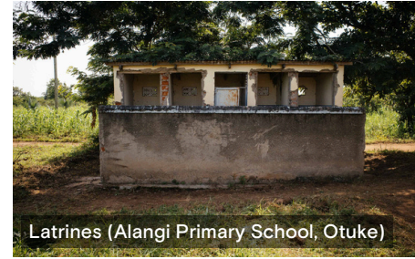
Latrines (Alangi Primary School, Otuke)