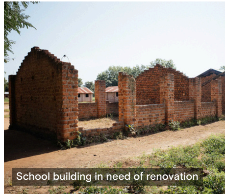
School building in need of renovation

A high-quality learning environment through the expansion of the school buildings, the minimization of health risks through the construction of sanitary facilities and the promotion of sustainable school development.