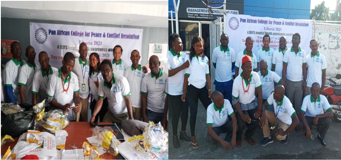
PAC RECEIVED MATERIAL DONATION FROM UNHCR LIBERIA