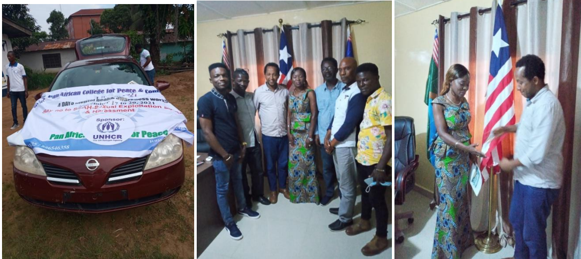
PAC received Financial Donation from ABC Cooperation Liberia