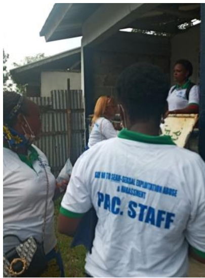
PARTICIPANTS REGISTRATION & LECTURE TIME DURING WORKSHOP