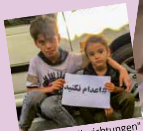
"Stoppt die Hinrichtungen"