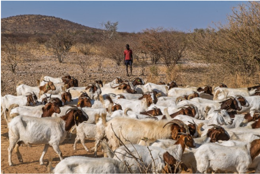
Life in Namibia is shaped by people, wildlife, and shared resources.

The Integrated Rural Development and Nature Conservation (IRDNC) was founded in the early 1980s to support Namibia's pioneering approach to community-based natural resource management, long before independence. Since then, IRDNC has played a key role in empowering rural communities to manage wildlife and natural resources sustainably.