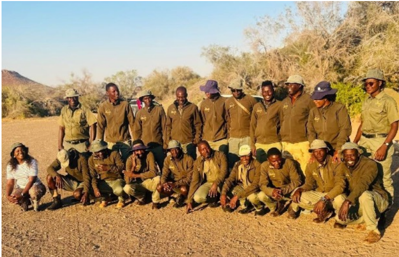
Rangers of the Kunene Elephant Walk