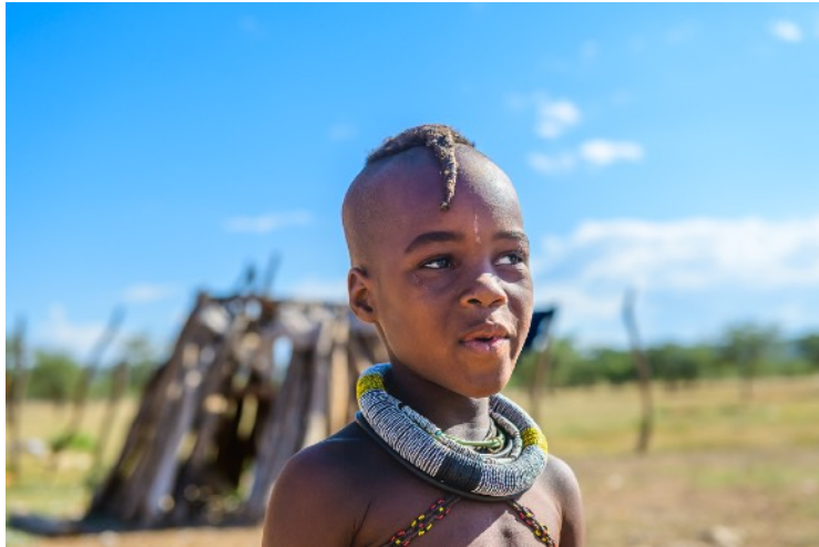
Himba boy from Kunene Region

People at the heart of wildlife protection