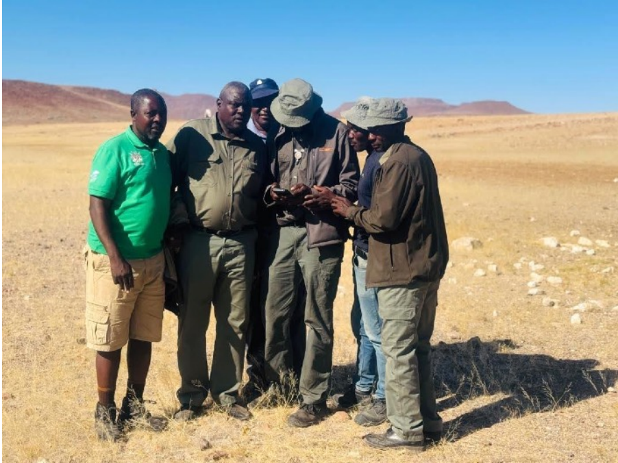
Kunene Region · Northwestern Namibia

Better coexistence through community engagement