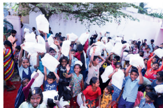
Nutrition Kit Distribution