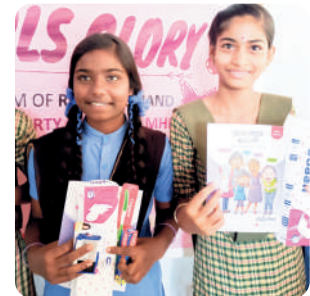
Sanitary pads & menstrupedia comic book distributed