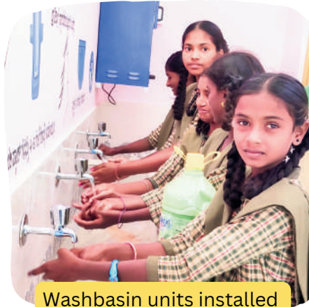
Washbasin units installed in a government school