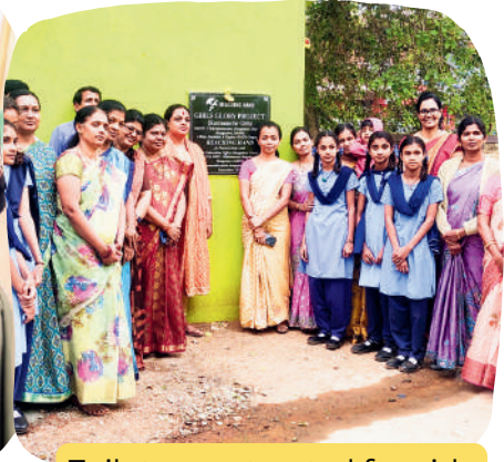
Toilets constructed for girls