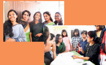
SEN CERTIFIED STAFF