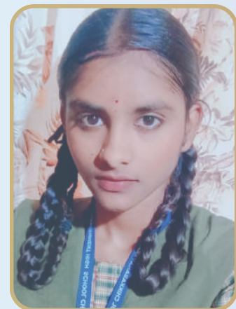
WASH COMMITTEE INITIATIVE

She has also educated her mother and her aunts on the tabbos and myths of menstruation