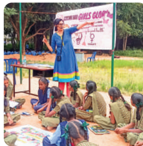
Menstrual Hygiene Management workshop