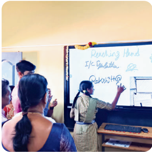
Digital Interactive Panel Installed