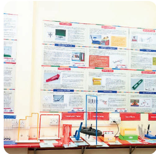
STEM Lab Installed