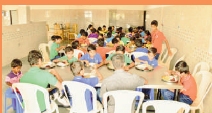
MID DAY MEALS