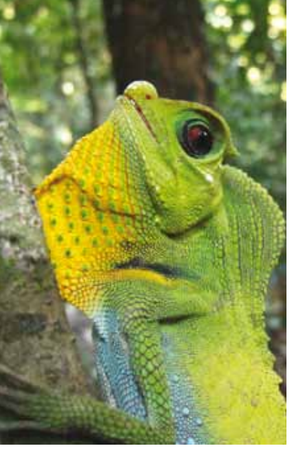
The rainforests of Sri Lanka contain dense pockets of endemic plant and wildlife species