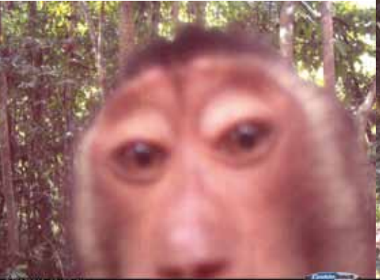
One of the now many curious wild Pig-tailed Macagues getting acquainted with one of the camera traps placed in the field