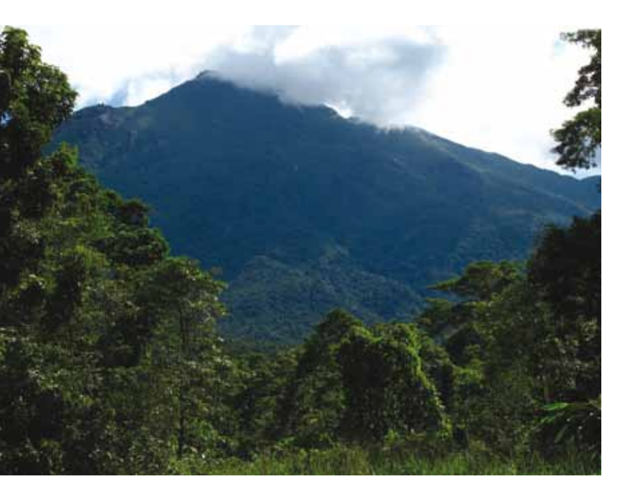
The Cassowary Conservation Reserve sits at the base of the spectacular Thornton's Peak in the Daintree Rainforest