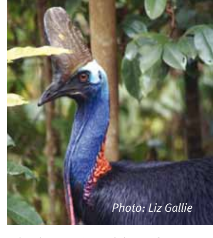
It has been estimated that as few as 1,000 wild Cassowaries remain in Australia

Cassowaries are often seen around our Baralba Corridor Nature Refuge. If you would like to visit, directions can be found on our Self-Drive Tour on our website, at www.rainforestrescue.org.au/ourprojects/ daintree-self-drive-tour.html