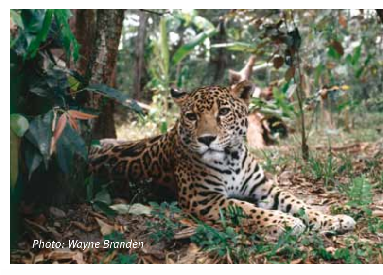
RAINFOREST CONCERN RESERVE Choco Andes Corridor Project - Ecuador South America RESERVE Choco Andes Corridor Project - Ecuador South America RESERVE Choco Andes Corridor Project - Ecuador South America RESERVE Choco Andes Corridor Project - Ecuador South America RESERVE Choco Andes Corridor Project - Ecuador South America RESERVE Choco Andes Corridor Project - Ecuador South America RESERVE Choco Andes Corridor Project - Ecuador South America RESERVE Choco Andes Corridor Project - Ecuador South America RESERVE Choco Andes Corridor Project - Ecuador South America RESERVE Choco Andes Corridor Project - Ecuador South America RESERVE Choco Andes Corridor Project - Ecuador South America RESERVE Choco Andes Corridor Project - Ecuador South America RESERVE Choco Andes Corridor Project - Ecuador South America RESERVE Choco Andes Corridor Project - Ecuador South America RESERVE Choco Andes Corridor Project - Ecuador South America RESERVE Choco Andes Corridor Project - Ecuador South America RESERVE Choco Andes Corridor Project - Ecuador South America RESERVE Choco Andes Corridor Project - Ecuador South America RESERVE Choco Andes Corridor Project - Ecuador South America RESERVE Choco Andes Choco Andes Choco Andes Choco Andes Choco Andes Choco Andes Choco Andes Choco Andes Choco Andes Choco Andes Choco Andes Choco Andes Choco Andes Choco Andes Choco Andes Choco Andes Choco Andes Choco Andes Choco Andes Choco Andes Choco Andes Choco Andes Choco Andes Choco Andes Choco Andes Choco Andes Choco Andes Choco Andes Choco Andes Choco Andes Choco Andes Choco Andes Choco Andes Choco Andes Choco Andes Choco Andes Choco Andes Choco Andes Choco Andes Choco Andes Choco Andes Choco Andes Choco Andes Choco Andes Choco Andes Choco Andes Choco Andes Choco Andes Choco Andes Choco Andes Choco Andes Choco Andes Choco Andes Choco Andes Choco Andes Choco Andes Choco Andes Choco Andes Choco Andes Choco Andes Choco Andes Choco Andes Choco Andes Choco Andes Choco Andes Choco Andes Choco Andes Choco Andes Choco Andes Choco Andes C

So far, a total of 1,467 hectares of this incredible Ecuadorian Cloud Forest has been purchased and protected forever. In the coming year, we will assist with further land purchase in this area. Rainforest Rescue is excited about this important work, and congratulates its supporters for their ongoing support in creating another positive outcome for the rainforest.