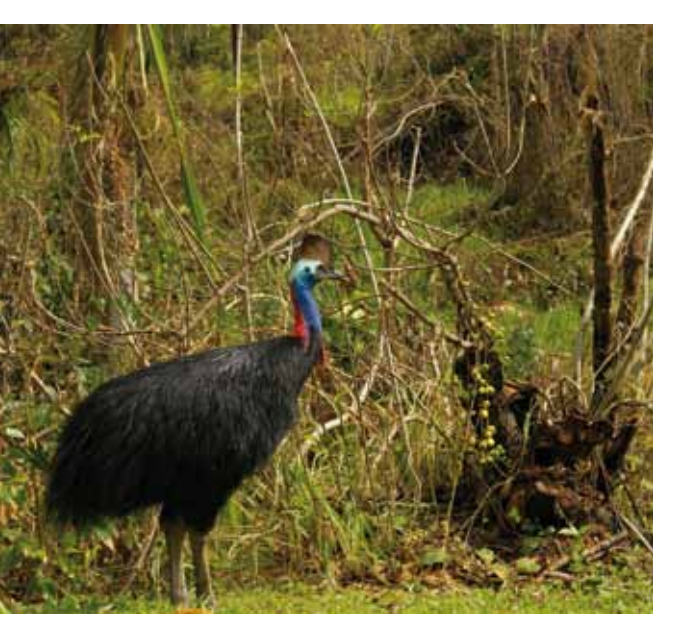
'Joov', a six year old Cassowary male, struggles to find food after Cyclone Yasi stripped the rainforest bare. Cyclone Yasi impacted 100,000 hectares of rainforest, which is 10% of the remaining prime Cassowary habitat. This photo was taken in Bingil Bay by Liz Gallie shortly after the cyclone

a vital role in the upkeep of biodiversity in the rainforests of Far North Queensland. Rainforest Rescue is committed to the long-term survival of the Cassowary throughout its range, from Townsville north to Cape York Penninsula.