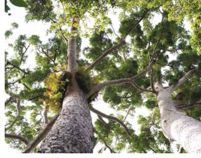
Living Agathis trees

The Research to the Rescue funding is all about contributing to this local, regional and global scientific initiative to improve our understanding of how rainforests work and how that understanding can improve our management and our capacity to protect and repair what remains.