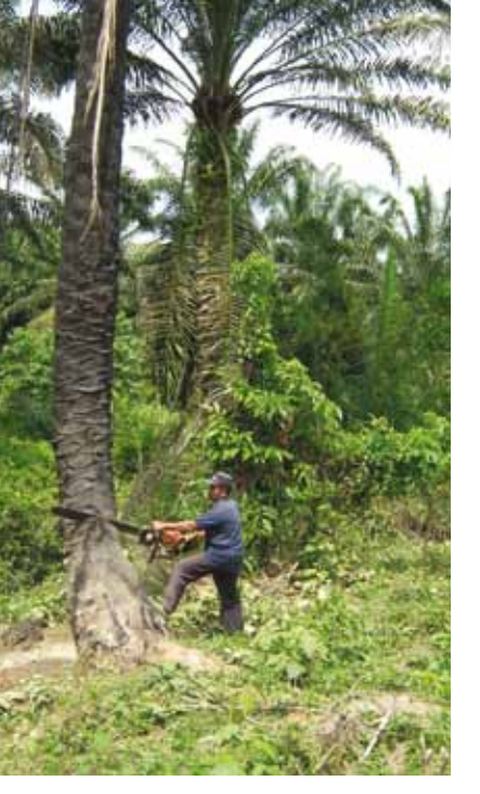
Once the oil palms have been cleared, it is encouraging to see how quickly the newly-planted rainforest trees grow and how the canopy is reforming.