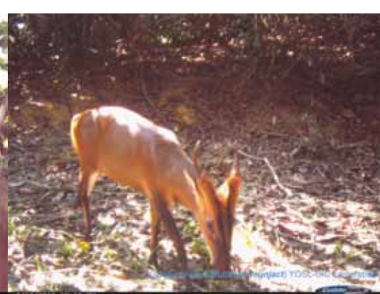
A Barking Deer photographed by a camera trap in the restoration site